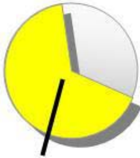
Adult problem solving skills

68% of adult Canadians need help to develop the problem-solving skills required in today's workplace.*