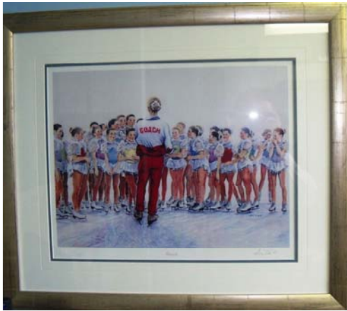
“Coach” by Les Tait 81/395 36 X47cm (visible image)

Nogy’s inspiration for his wonderful nature scenes comes from the many excursions he takes into the lakes and forests around Georgian Bay. His watercolours have been prominently displayed at the Buckhorn Wildlife Art Festival and the Society of Animals Artists show, in New York. In 1997 he won the design contract to create four collector sets for the Royal Canadian Mint.