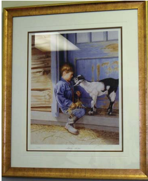
“Barn Kids” by Arnold Nogt 111/395 46X37cm (visible image)